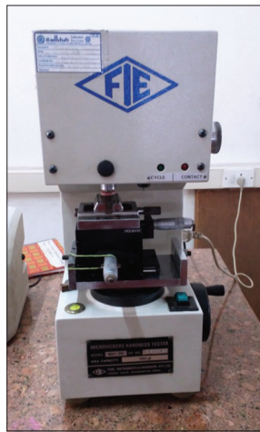
Figure 4: Hardness measurement using Vicker's hardness tester (original photograph)