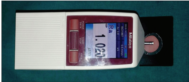
Figure 3: Surface roughness measurement using profilometer (original photograph)