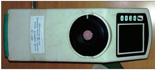
Figure 2: Color measurement using spectrophotometer (original photograph)