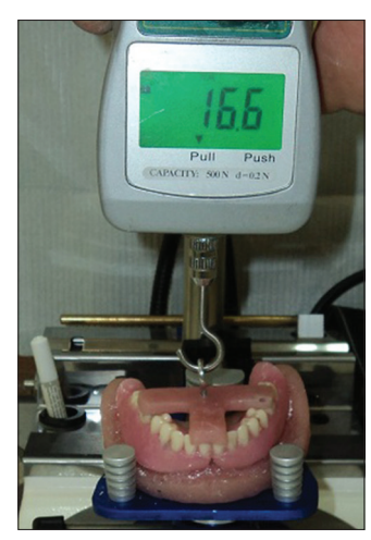
Figure 3: Retention measured with digital force gauge (original photograph)

At each measurement point, a comparison of retentive values was made using one-way analysis of variance with retention (dependent variable) and simulated insertions (independent variable). The significance set at P < 0.05. Student's t -test was used to compare between the