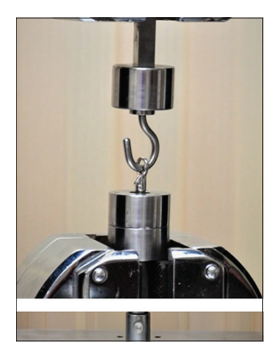
Figure 5: Close-up of testing sample