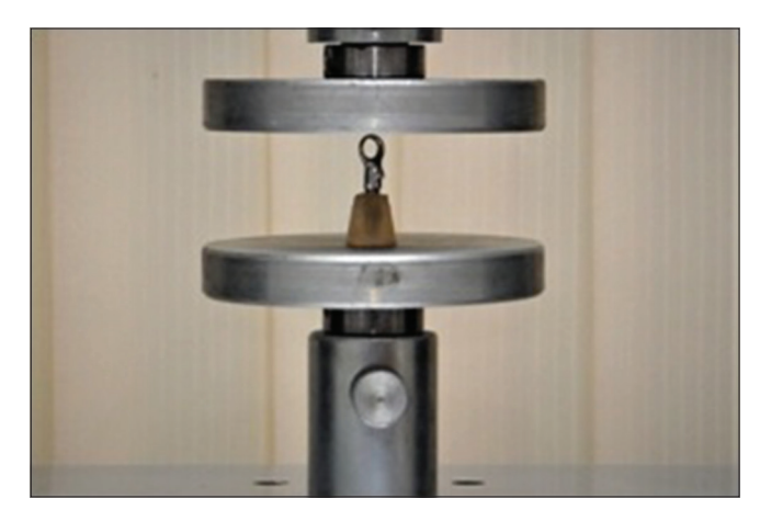
Figure 3: Application of load

Post hoc Bonferroni test was done for multiple comparisons. It was observed that there is no statistically significant difference between the group PIC and TB. However, the groups PIC and TB when compared with ILC and showed statistically significant difference in values between each groups (P < 0.001) [Table 3].