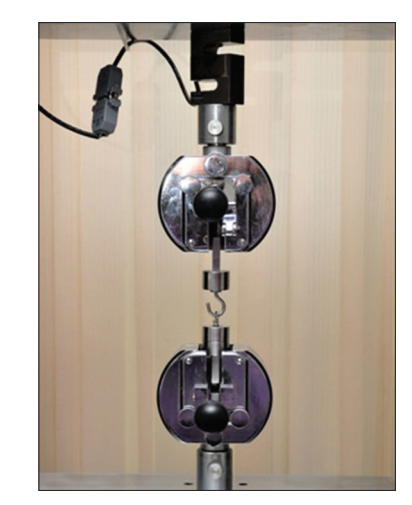
Figure 4: Crown pull test using universal testing machine

In this study, although the result was not statistically significant between PIC and TB, the noneugenol temporary resin cement (PIC) showed slightly better retentive property than that of noneugenol zinc oxide cement (TB). Noneugenol temporary resin cement provided secure retention and excellent marginal seal. It is a very tough resin that uses mechanical retention to adhere the crown to the abutment. Yet, when desired, the restoration can be removed easily due to its unique elasticity. Different coefficients of thermal expansion of the materials, a poor marginal seal provided by zinc oxide cements and its high solubility in water could have been the factors responsible for this observation.<sup>[12]</sup>