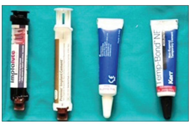
Figure 1: Luting cements used

One-way ANOVA was used to compare the mean tensile strength (MPa) between the cement groups at 4 mm abutment height. It was observed that there was a significant difference in the tensile strength between the cement groups; PIC had the highest tensile strength ( 0.77 \pm 0.13 ) followed by TB (Temp-Bond<sup>TM</sup> NE - 0.67 \pm 0.25 ) and the least strength was observed in ILC (ILC - 0.23 \pm 0.12 ) with P < 0.001 [Table 1]. The same observation was noted with 5.5 mm abutment height [Table 2].