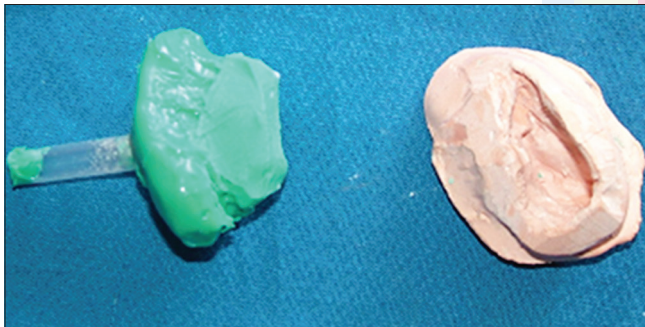
Figure 4: Impression and cast

The wax pattern with the master cast is then invested. When the flask is opened after dewaxing procedure, the eye shell is secured firmly to a single component of the flask. Room temperature vulcanization silicone (A-2186, Factor II incorporated) was packed into the mold with intrinsic stains. After curing, recover the prosthesis followed by extrinsic staining to match the skin colour and eyelashes were attached using patient's own hair. The extraoral silicone prosthesis was delivered to the patient