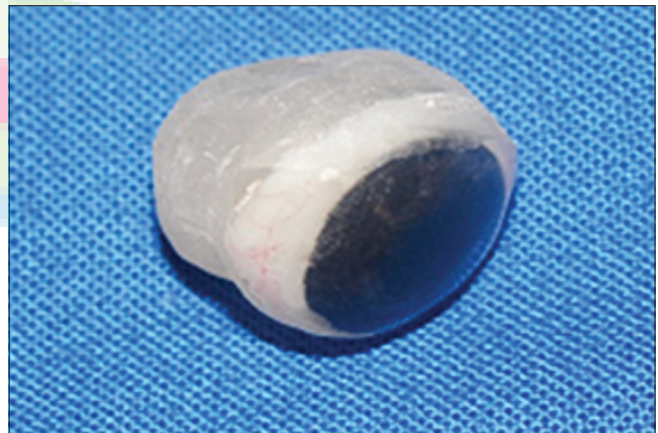
Figure 5: Prosthesis